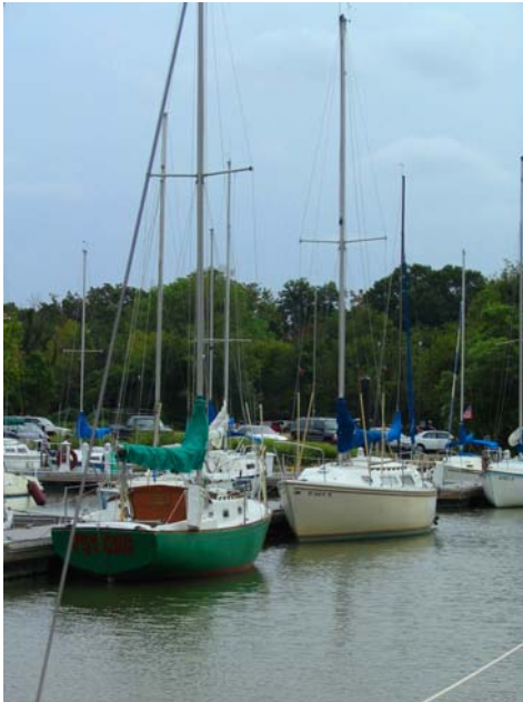
SCOW – Cruisers Psycho and Rebecca