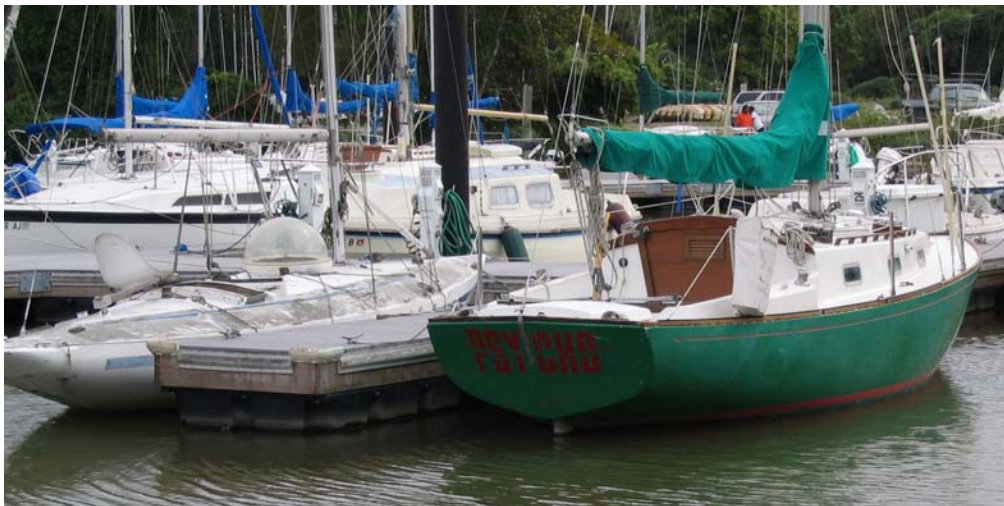
SCOW Psycho at Dock