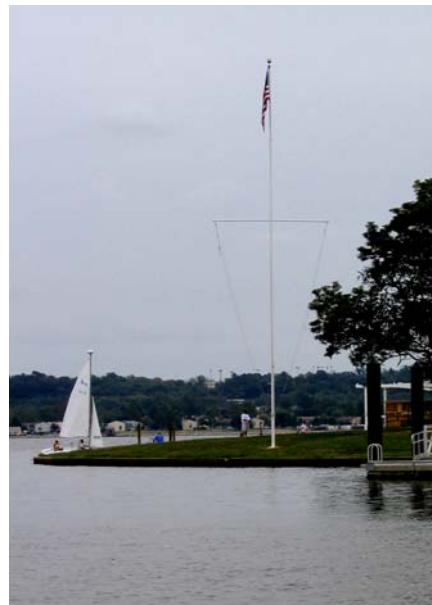
SCOW Late Summer Doldrums

Be sure to check out the website www.scow.org for a complete calendar of racing, sailing and social activities!