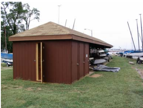
SCOW New Lockers

“Being hove to in a long gale is the most boring way I know of being terrified.”