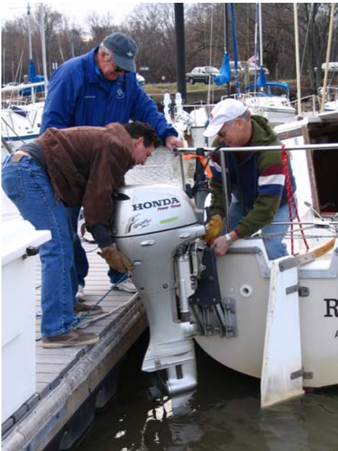
Refurbished Motors are back on the Cruisers!