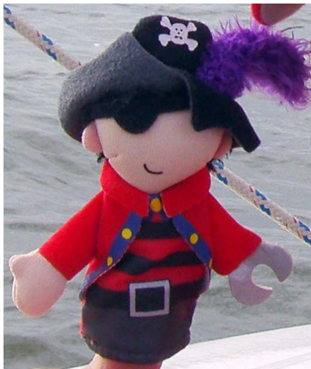
Here's the Commodore's First Mate! "Can You Choose The Name?"

Reviewing safety procedures and skills are, without a doubt, the most important maintenance activity that a sailor can pursue.