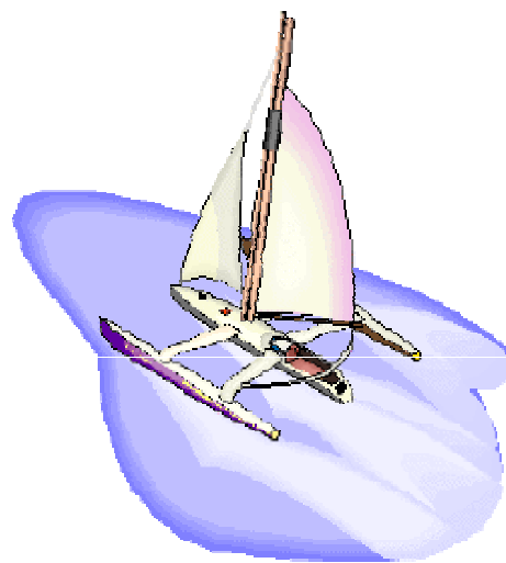
Trimaran (3 Hulls)