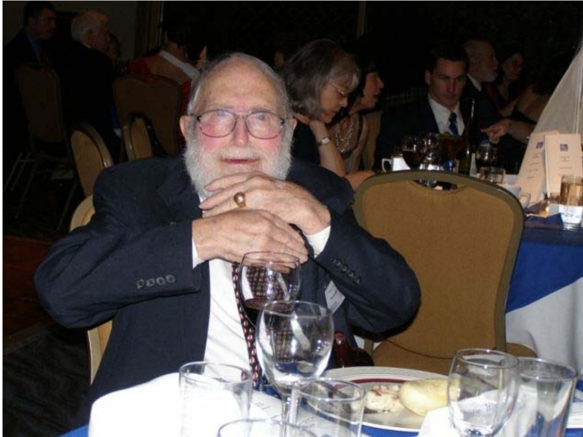
Woodie at SCOW Hail & Farewell Dinner 2008