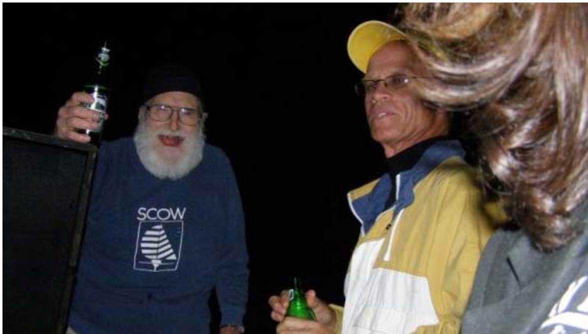
Woodie at SCOW Octoberfest 2008