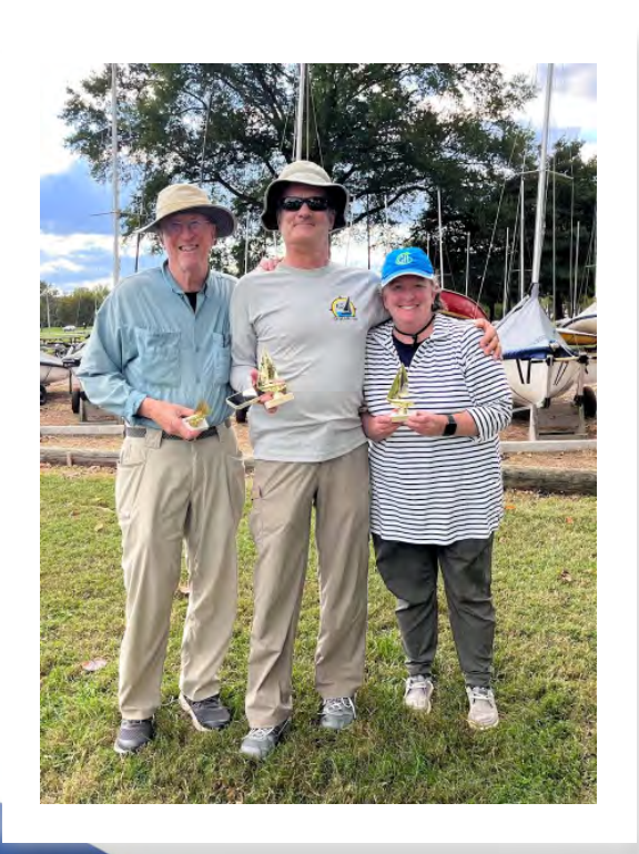
3rd Place - Double D