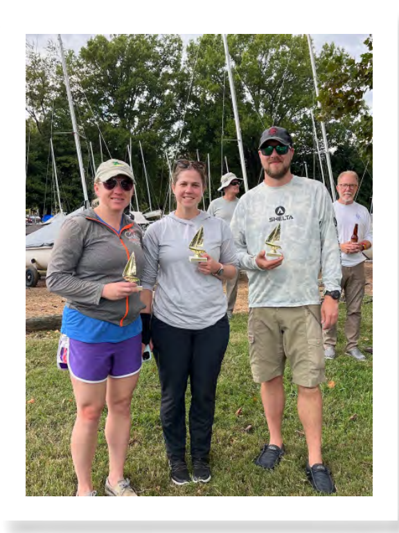
1st Place Club Boat - Andiamo