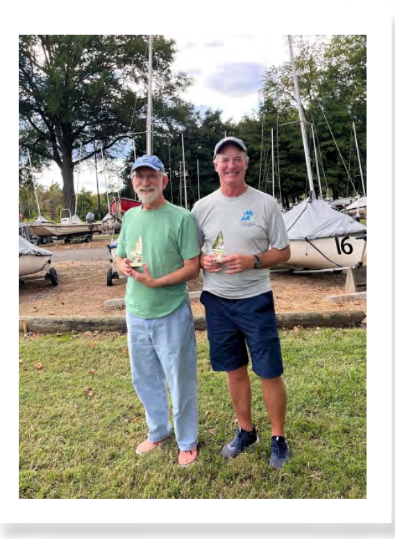
2nd Place - Bodacious