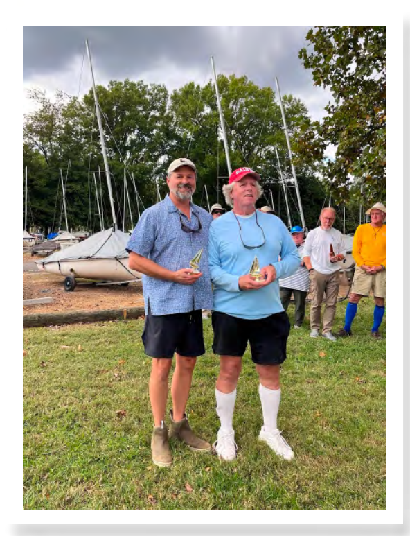
1st Place - Aeolus