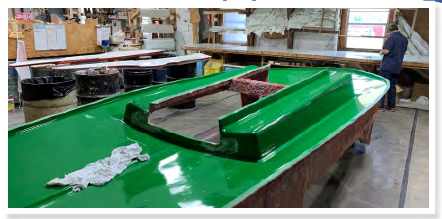
FS deck upside down being prepared to seal with hull