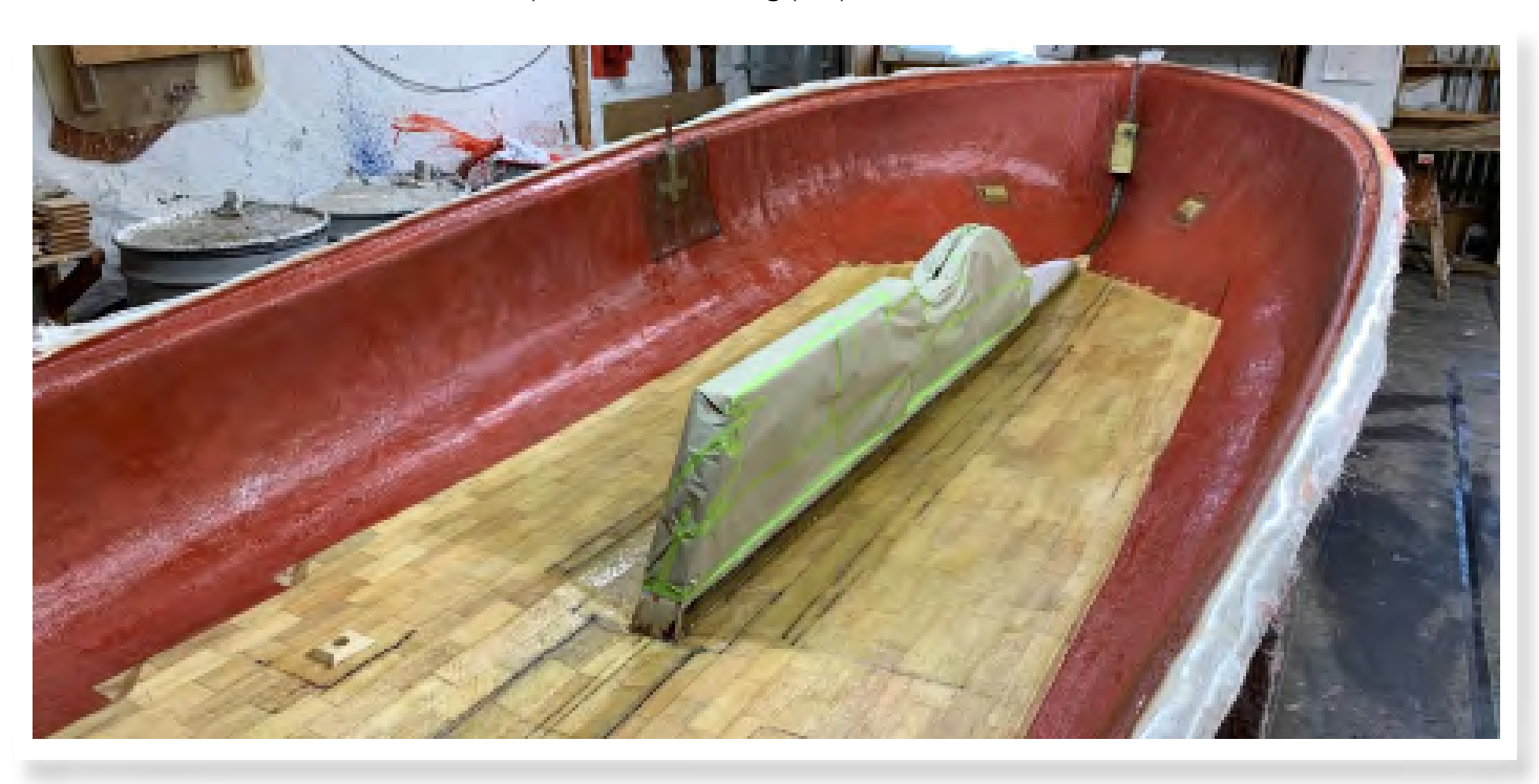
Hull in the mold – balsa laid out – ready for next layer of fiberglass