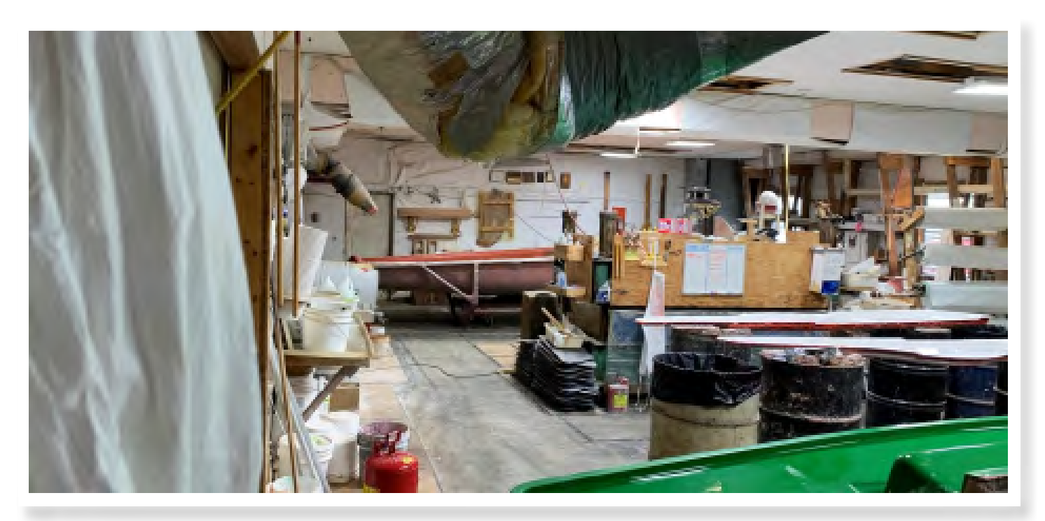
Wide view of the factory floor