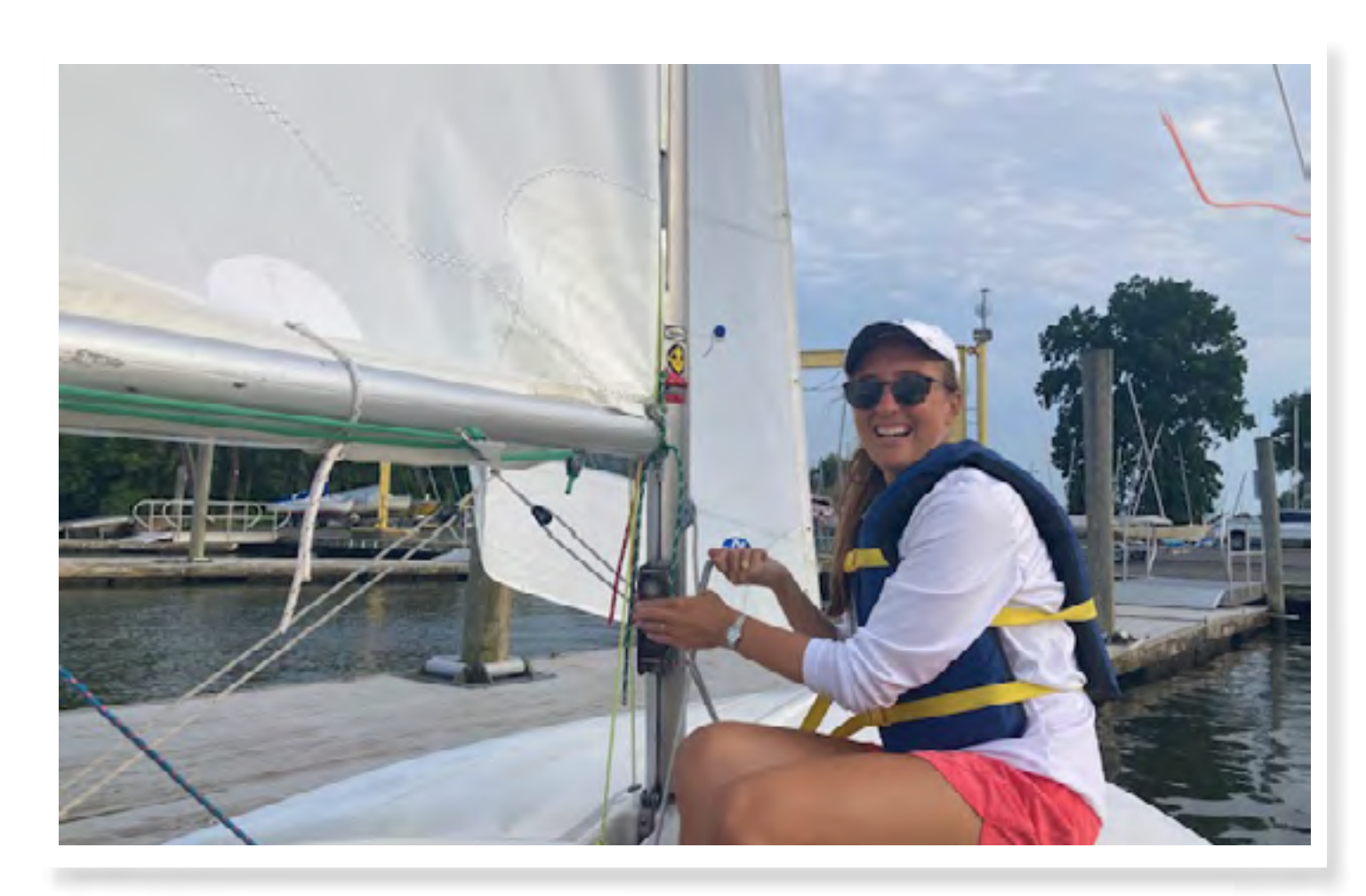
Zan & Flying Scot